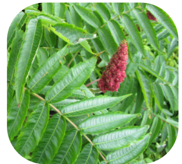
Leaves and seed head cluster of staghorn sumac.