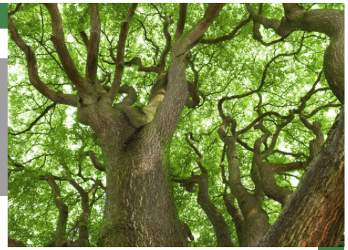
Tree of Heaven ( Ailanthus altissima )

Proper identification of tree of heaven is important in helping to eradicate this invasive pest. Although tree of heaven is an invasive plant, there are several native trees that are similar-looking. It's important to distinguish these from tree of heaven so that these look-alikes are not removed.