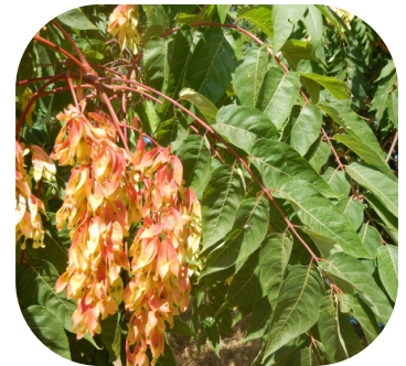
Leaves and winged seed pods of tree of heaven.