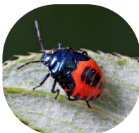
Stink Bug (nymph)