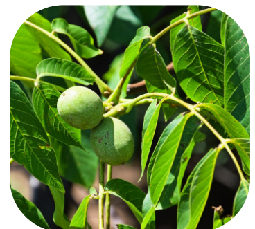
Leaves and fruit of a black walnut.